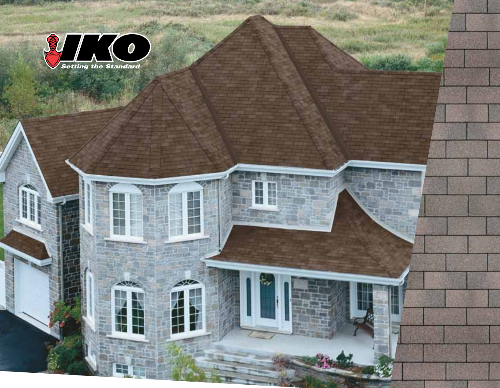
Color Featured: Driftwood